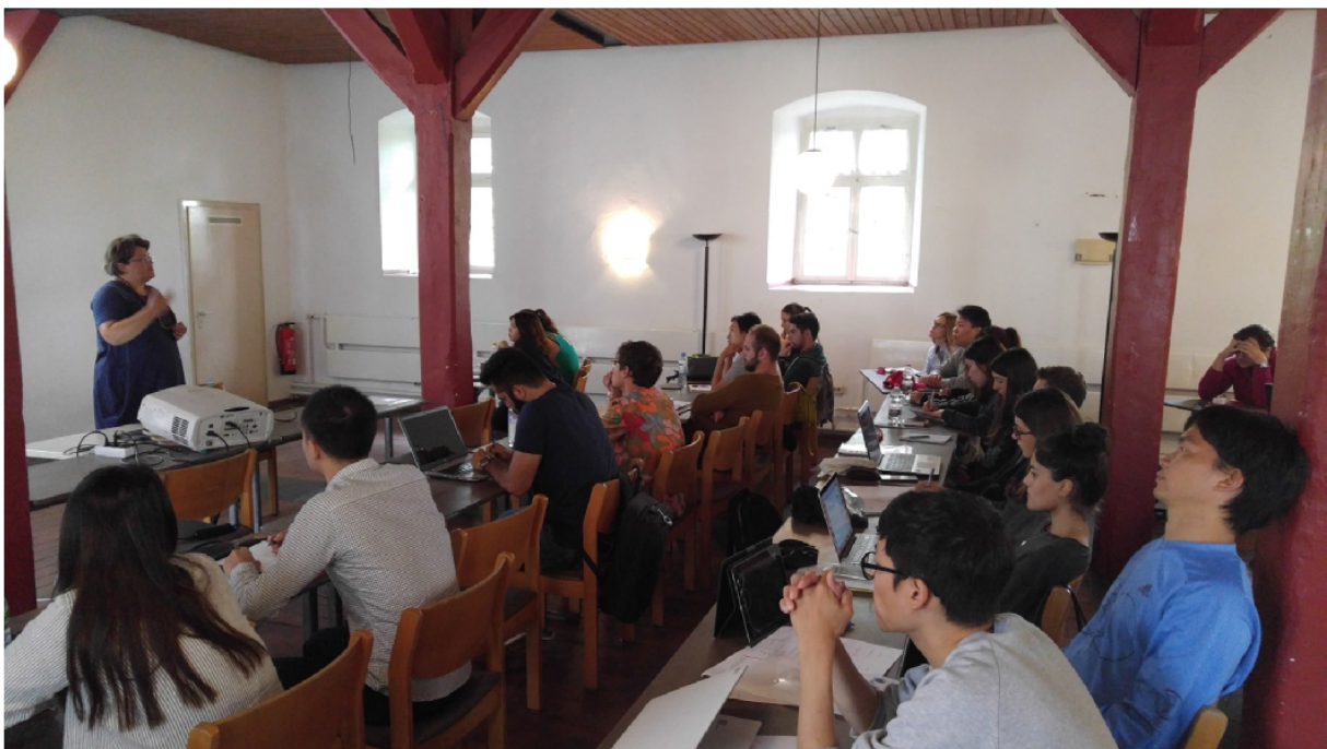
Figure 1: Teaching at ESSIS 2017

During a social event on Wednesday afternoon, all teachers and students travelled to the city Herzberg which is situated in the Harz. The program consisted of a visit to the castle with a museum and a walk through the old town. This social event was very helpful for all students to get acquainted with each other.